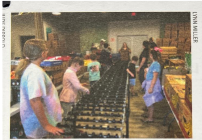
The children of Limestone Presbyterian Church in Gaffney, S.C., pack FoodShare boxes.