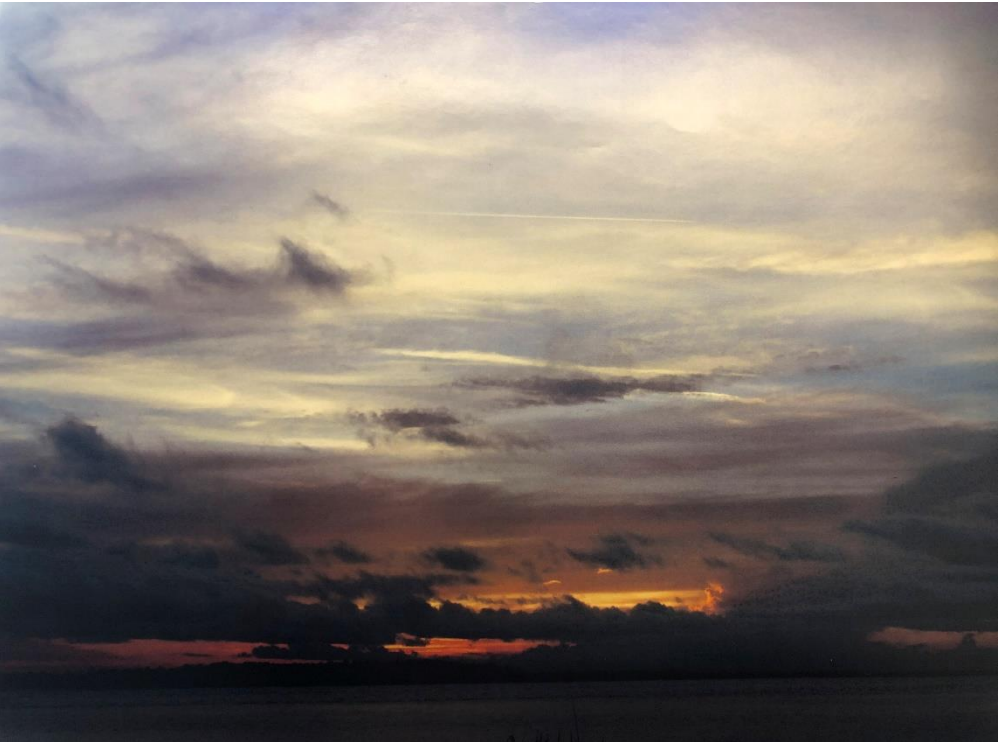
For thine is the kingdom and the power and the glory forever.