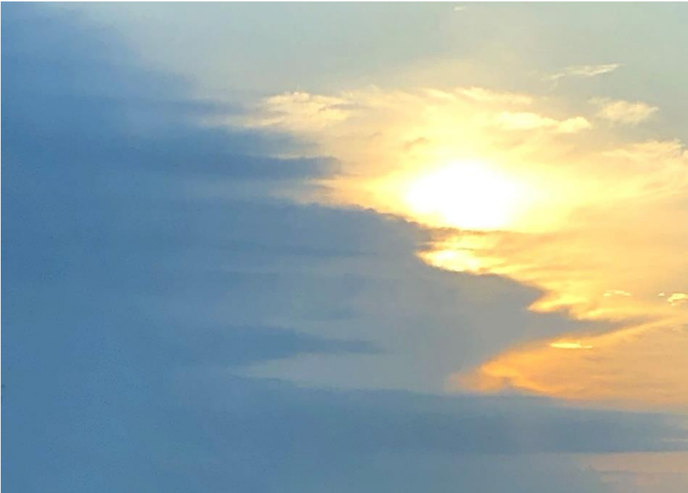
Our Father, who art in heaven, hallowed be thy name...