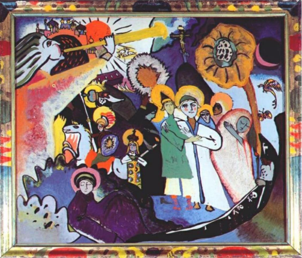
Wassily Kandinsky. All Saints I. 1911. Reverse glass painting. Lenbachaus, Munich, Germany.