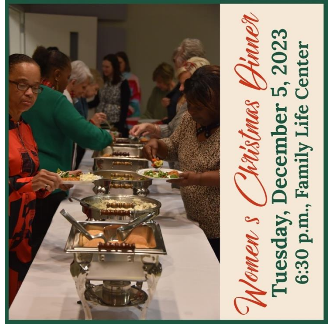
Women's Christmas Dinner Tuesday, December 5, 2023 6:30 p.m., Family Life Center