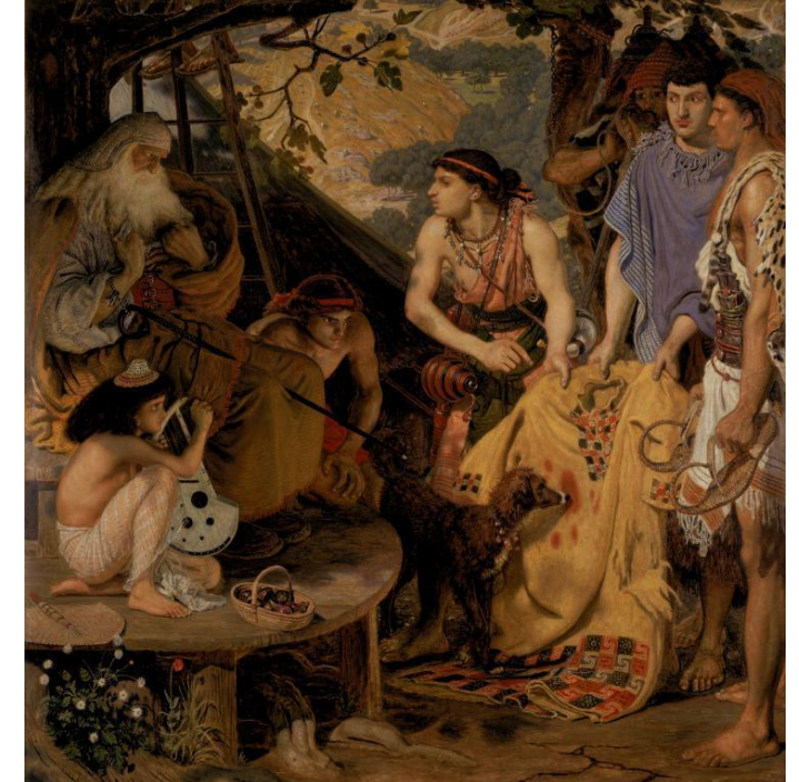
Ford Madox Brown. The Coat of Many Colors. 1866. Walker Art Gallery, Liverpool.

WE ARE THE PEOPLE OF A LOVING GOD, GATHERING, GROWING, GIVING, AND GOING TO SERVE, TOGETHER