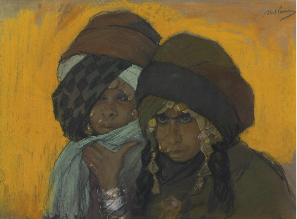
Abel Pann (1883–1963). Rachel and Leah . Pastel on paper.

Rachel and Leah appear as symbols in "Purgatory," the middle poem of The Divine Comedy by Italian poet Dante Alighieri. Young and beautiful, Leah gathers flowers to make into a garland, and she tells how her sister Rachel never stops observing her reflection in a mirror. In their roles of "doing and seeing," Leah and Rachel were conventionally viewed as symbols, respectively, of the active and contemplative lives. Dante favored contemplation over action. He wrote, We must know, however, that we may have two kinds of happiness in this life, according to two different paths, one good and the other best, which lead us there. One is the active life, the other the contemplative life, and although by the active, as has been said, we may arrive at a happiness that is good, the other leads us to the best happiness and state of bliss.