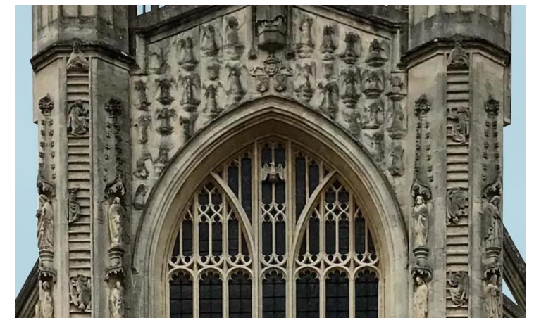
Facade of Bath Abbey. Bath, England. Begun 1499.

One of the tales we often tell our children is of Jack, who climbed a beanstalk that reached up to the heavens. Jack and Jacob have things in common besides a structure that connected earth and sky. Both are tricksters -- Jacob securing the birthright and blessing by less-than-noble means and Jack tricking the Giant out of his treasure. However, Jack had to chop down the beanstalk to free himself from the giant in the sky. Jacob left his encounter with the promise that God would be with him always. What other similarities and differences do you see between the two stories?