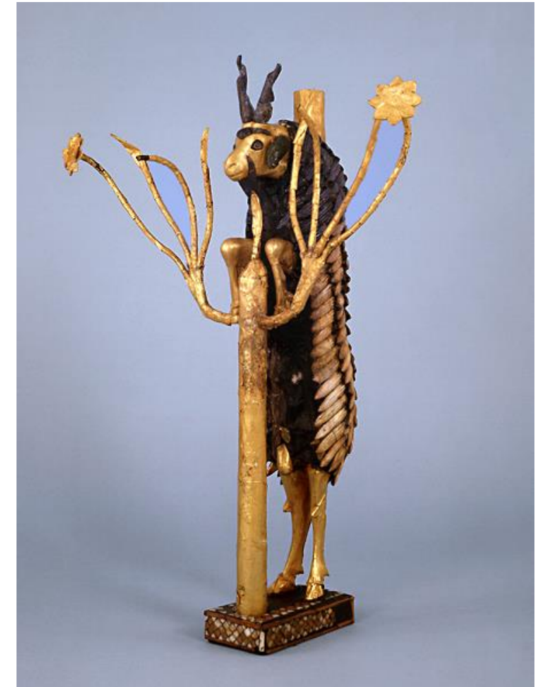
'Ram in a Thicket', about 2600–2400 B.C.E., Sumerian, found in tomb PG 1237, Royal Tombs of Ur, southern Iraq, gold, silver, lapis lazuli, shell, bitumen, copper alloy, and red limestone, 45.7 x 30.48 cm

WE ARE THE PEOPLE OF A LOVING GOD, GATHERING, GROWING, GIVING, AND GOING TO SERVE, TOGETHER