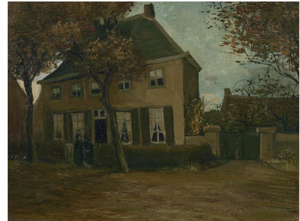
Vincent van Gogh. The Manse at Nuenen. September-October 1885. Oil on canvas. Van Gogh Museum, Amsterdam.

WE ARE THE PEOPLE OF A LOVING GOD, GATHERING, GROWING, GIVING, AND GOING TO SERVE, TOGETHER