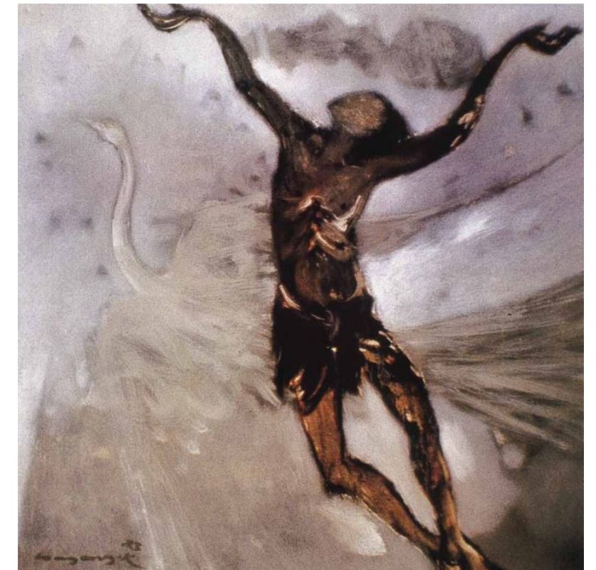
Bagong Kussudiardja (Indonesian, 1928–2004), Ascension , 1983.

WE ARE THE PEOPLE OF A LOVING GOD, GATHERING, GROWING, GIVING, AND GOING TO SERVE, TOGETHER