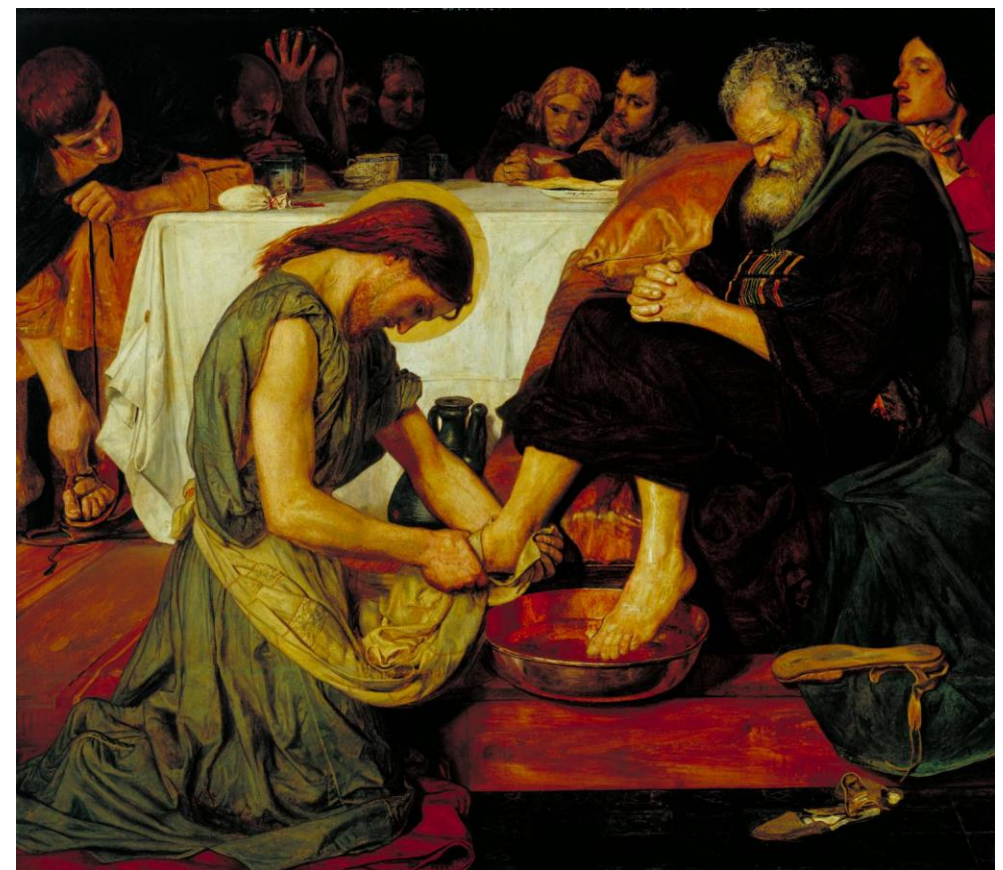
Ford Madox Brown. Jesus Washing Peter's Feet. 1852-1856. London: Tate Gallery.

WE ARE THE PEOPLE OF A LOVING GOD, GATHERING, GROWING, GIVING, AND GOING TO SERVE, TOGETHER