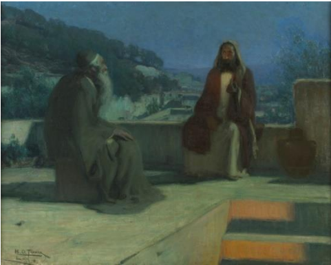
Henry Ossawa Tanner. Nicodemus at Night. 1899. Philadelphia: PA Academy of Fine Arts.