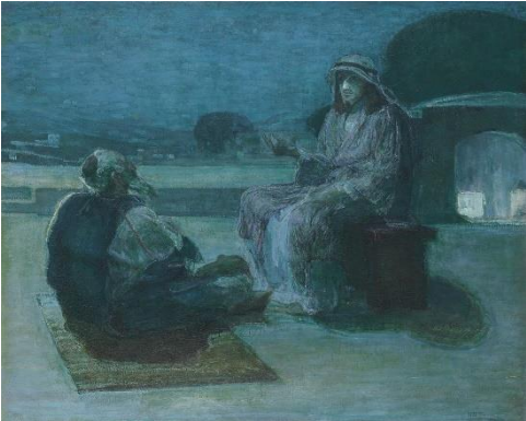
H.O. Tanner. Nicodemus Before Christ. 1927. Private Collection

Here are three versions of the same subject by the same artist. There are differences in the three pieces. As you hear the story read in worship, consider...which figure - Nicodemus or Jesus - is shadowed and which is in light? Is there something - like a halo - that sets Jesus apart as not-of-this-world? Why did the artist paint Jesus' back to the city? What does it mean that Nicodemus always looks at Jesus and sees the town in the background? Why - if Nicodemus is so afraid of being found out at visiting Jesus - is the meeting outdoors? What do the levels of the two heads tell us? Is Nicodemus way below Jesus or about level with Jesus? How do these compare with the story as you imagine it happening?