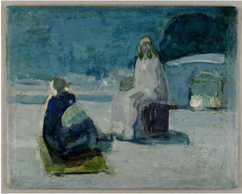
H.O. Tanner. Study for Christ and Nicodemus on a Rooftop. c. 1923. Smithsonian American Art Museum.