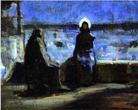
H.O. Tanner. Study for Nicodemus Visiting Jesus. 1899. Private Collection