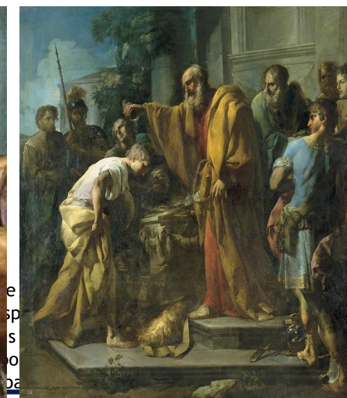
Antonio Gonzalez Velazquez. The Anointing of David by Samuel. 18th century. Madrid, Spain: Royal Academy of Fine Arts of San Fernando.