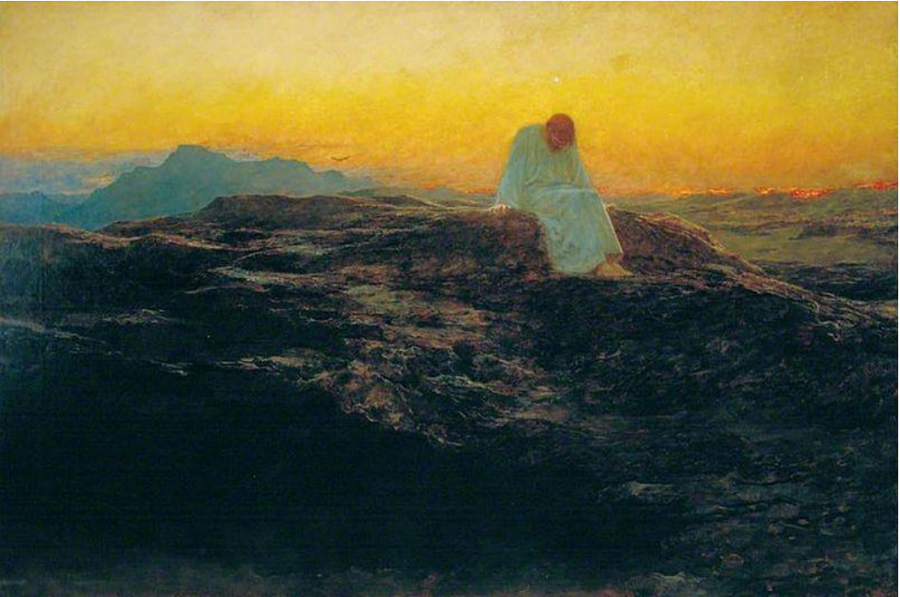
Briton Riviere. Christ in the Wilderness . 1898, London: Guildhall Art Gallery.

WE ARE THE PEOPLE OF A LOVING GOD, GATHERING, GROWING, GIVING, AND GOING TO SERVE, TOGETHER