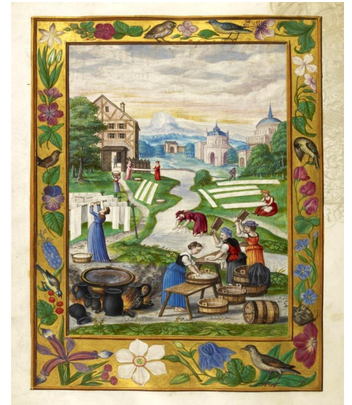
Women Washing Clothes from Splendor Solis . Harley 3469, f. 32v. British Library. 1582. Origin: Germany.

WE ARE THE PEOPLE OF A LOVING GOD, GATHERING, GROWING, GIVING, AND GOING TO SERVE, TOGETHER