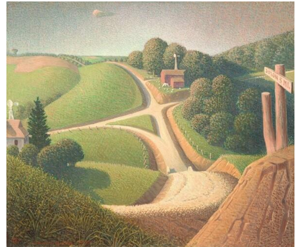
Grant Wood. New Road . 1939. Washington, DC: National Gallery of Art.

WE ARE THE PEOPLE OF A LOVING GOD, GATHERING, GROWING, GIVING, AND GOING TO SERVE, TOGETHER