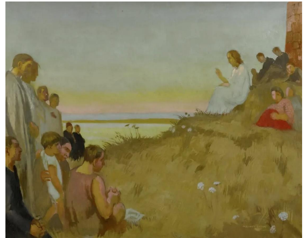
Maurice Denis. Sermon on the Mount. 1934. Eglise St. Nicasius, Reims, France.

WE ARE THE PEOPLE OF A LOVING GOD, GATHERING, GROWING, AND GOING TO SERVE, TOGETHER