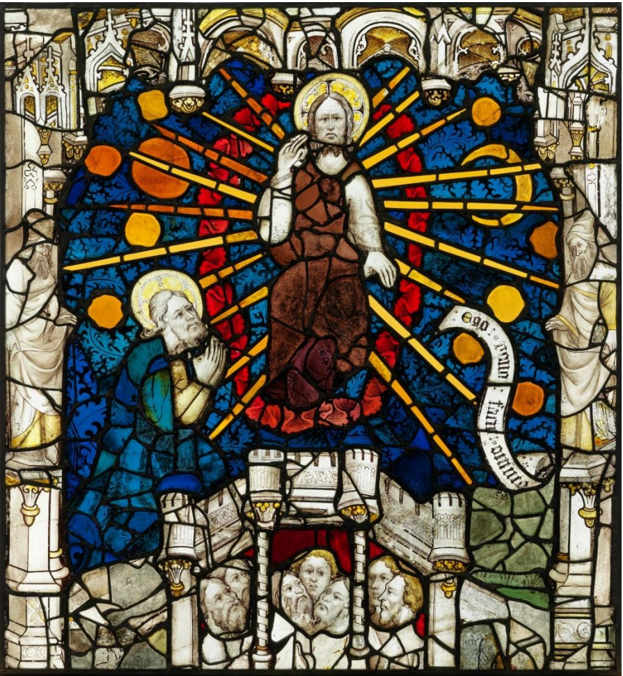
“Behold, I Make All Things New.” 1405-1408. Great East Window, York Minster. York, UK.

LIMESTONE PRESBYTERIAN CHURCH, PC(USA) WE ARE THE PEOPLE OF A LOVING GOD, GATHERING, GROWING, GIVING, AND GOING TO SERVE, TOGETHER