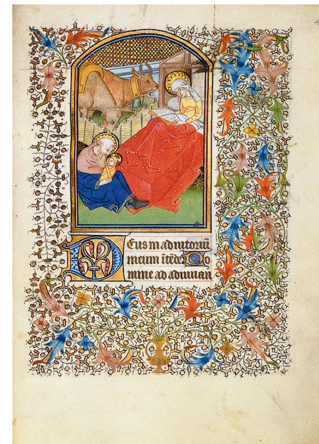
Illumination from the 15th-century Besançon Book of Hours showing the Nativity with Mary reading while Joseph cradles the Christ Child. Fitzwilliam MS 69 folio 48r. Vellum. 22.2 x 16.5 cm. The Fitzwilliam Museum, Cambridge, England, UK.

WE ARE THE PEOPLE OF A LOVING GOD, GATHERING, GROWING, GIVING, AND GOING TO SERVE, TOGETHER