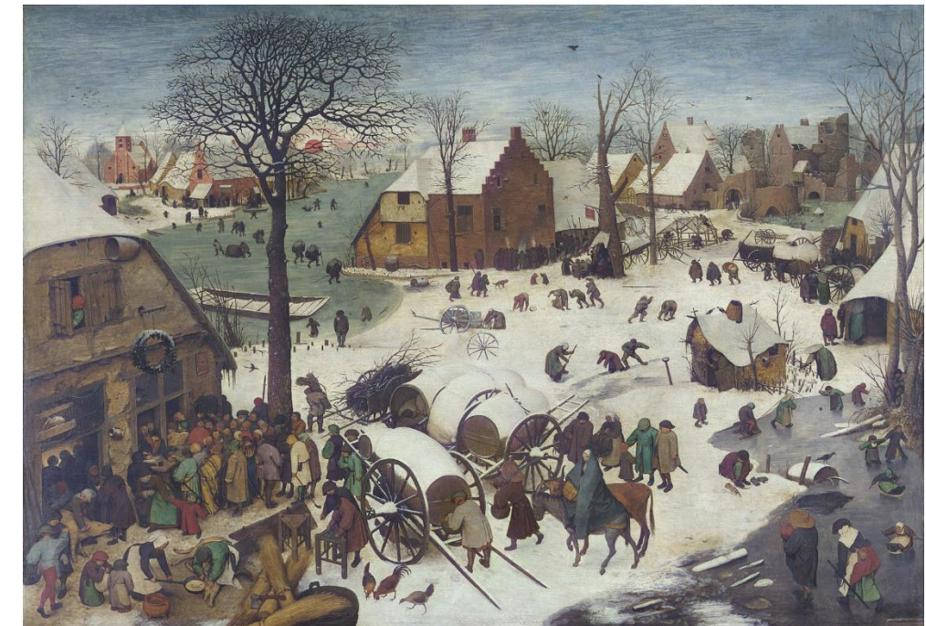
Pieter Bruegel. The Numbering at Bethlehem . 1566. Royal Museums of Fine Arts Belgium

WE ARE THE PEOPLE OF A LOVING GOD, GATHERING, GROWING, GIVING, AND GOING TO SERVE, TOGETHER