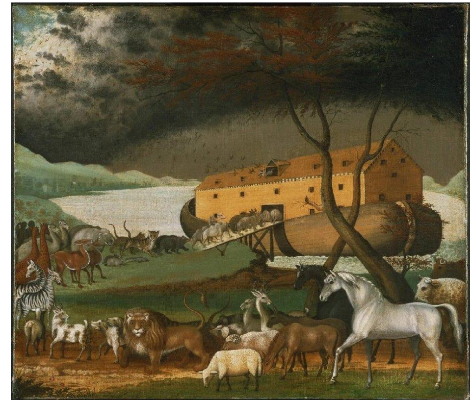
Edward Hicks. Noah's Ark . 1846. Philadelphia Museum of Art.

WE ARE THE PEOPLE OF A LOVING GOD, GATHERING, GROWING, GIVING, AND GOING TO SERVE, TOGETHER